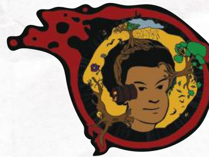
A REVAMP OF THE MOFUNK LOGO INTO A REFRESHING ASTEROID-LIKE DESIGN TO SIGNIFY BRINGING IN A NEW WORLD INTO THE HOUSE MUSIC SPACE.

This portfolio showcases the transformative power of multiple mediums to attract new audiences, enhance product innovation, and expand market access. Mofunk Records, a Johannesburg-based label founded in 2005, experienced a transformative phase under my art direction, which contributed to the brand winning an award with Acquisition International while continuing to evolve its deep and soulful house music into a globally recognized catalog.