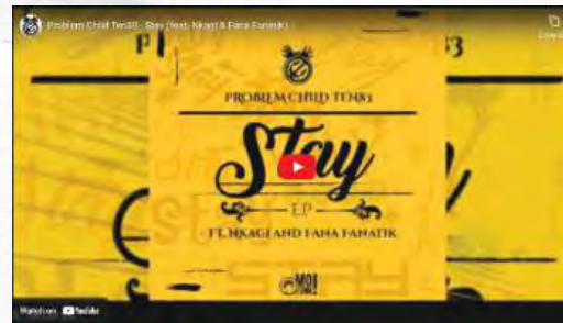
WITH THE USE OF FL STUDIO'S ZGAME ENGINE AND ADOBE ILLUSTRATOR, I MADE AN ANIMATED VISUAL FOR PROMOTION OF THE STAY EP SHOWCASING THE SPINNING VINYL WHICH BECAME A TREND THE FOLLOWING YEAR.