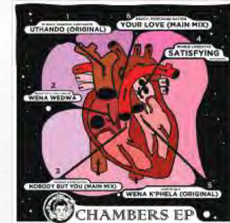
ONE OF THE FIRST INSTALMENTS OF THE 15 YEARS OF MOFUNK CAMPAIGN, CHAMBERS EP WAS A MOMENT CAPTURED BEYOND THE GENRE OF DEEP AND SOULFUL HOUSE MUSIC, AND THUS A WELL DESIGNED COVER ART THAT SHOWCASED THE TRACKLIST AS WELL AS THE METAPHOR OF THE HEART.