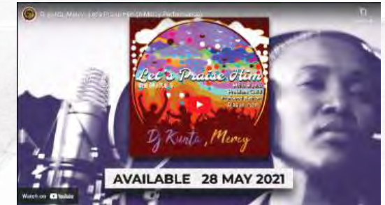
A LIVE PERFORMANCE CAPTURED AND EDITED FOR PROMOTION USING ADOBE AFTER EFFECTS AND PREMIERE PRO. I CREATED THE TITLE SEQUENCE AND EDITS, AND WAS BEHIND THE CAMERA ON ONE OF THE ANGLES.